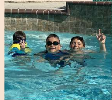
Pool day with cousins